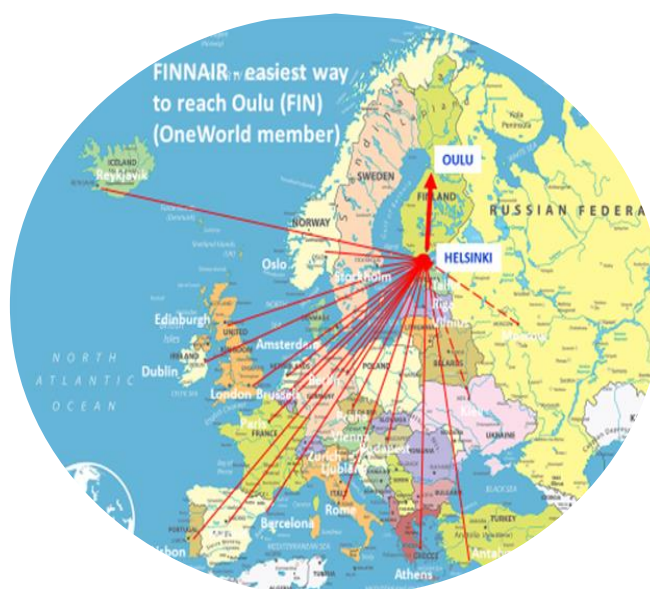
Picture 2. Easiest way to reach Oulu is via Helsinki airport from all member countries.

Oulu region may be reached quite easily also via Sweden. The city of Luleå has its own airport from which it is 270 km drive to Oulu region. Furthermore, all the road network of Norway and Sweden can be utilized to entry to Finland. The border control is located between the cities of Haparanda (SWE) and Tornio (FIN).